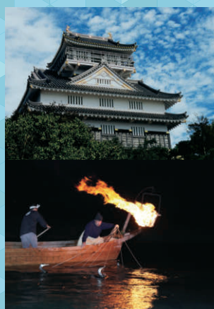
Photos from Gifu City

Gifu University is located north of Gifu City with a population of approximately 400,000. The city is rich in history and beautiful natural environment symbolized by Gifu Castle, the former residence of Oda Nobunaga, a powerful Daimyō of Japan in the late 16th century. The castle on top of Mt. Kinka looks down the Nagara River where Japan's largest fireworks display is held every summer. In addition, cormorant fishing, a traditional fishing method that uses trained cormorants to catch river fish, continues to be practiced along the river for centuries (from May to October).