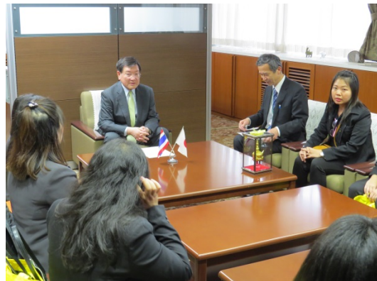
Meeting with the president