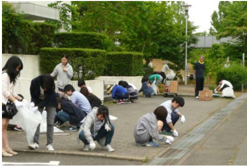
Cleanup activity within campus