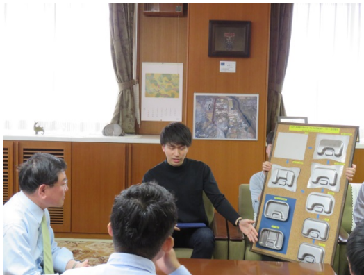
A student reporting to the president