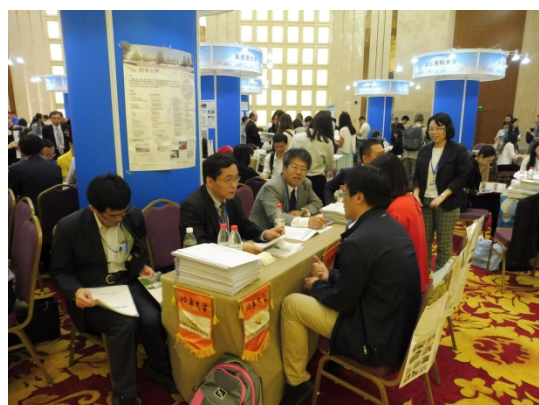
Scene of the meeting in Shanghai

The “China-Japan University Fair & Forum in China 2017” ended with a great success paving the way for securing skilled personnel, implementation of joint research programs and technological transfer in the future.