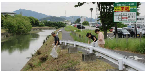
Cleanup activity along Shinbori River