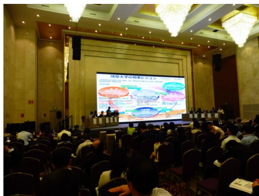
Scene of subcommittee meeting

Gifu University introduced and exhibited information about studying at Gifu University for students in China, information about industry, government and academia collaboration, research results and technology resources at its booth set up at the Shanghai venue after the subcommittee meetings were over on May 14, and at the Hangzhou venue in the afternoon of May 15. Many people from universities, research institutes and private companies in China visited the Gifu University booth.