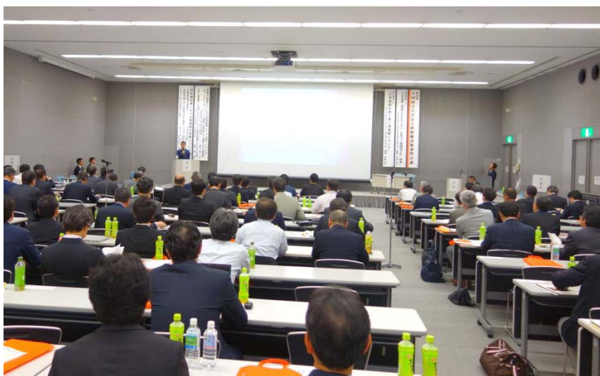
Scene of the meeting

Presentations by specialists, active discussions and information-sharing from multiple viewpoints all contributed to the meeting’s great success.