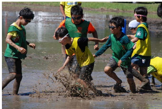
Children playing soccer in the mud