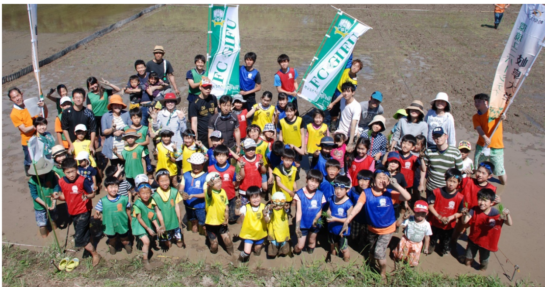
A total of 68 participants of rice planting including children and their parents