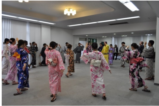
Students practicing “Kawasaki” dance