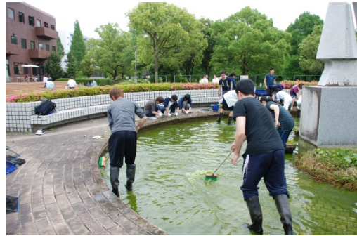
Cleanup activity of Maruike Pond