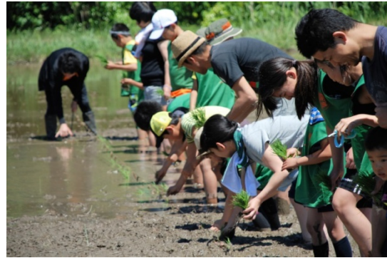
Participants planting seedlings