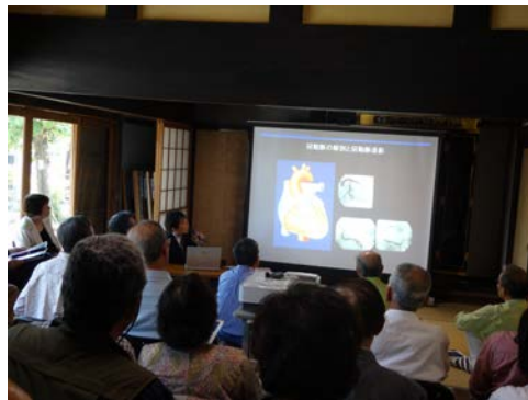
Scene of the Delivery Lecture