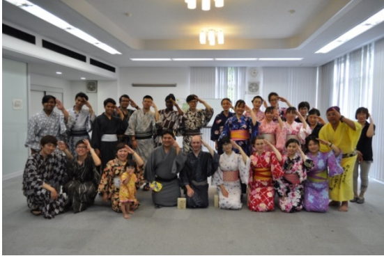
Group photo with “Kawasaki” pose

At the end of the workshop, all joined a commemorative photo-taking session and the 6 th Gujo Dance Workshop marked another great success this year.