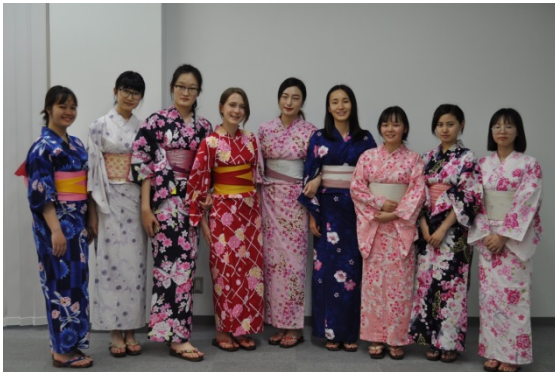
Girl students in kimono