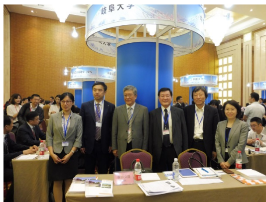
Gifu University delegates and people from Harbin University of Science and Technology