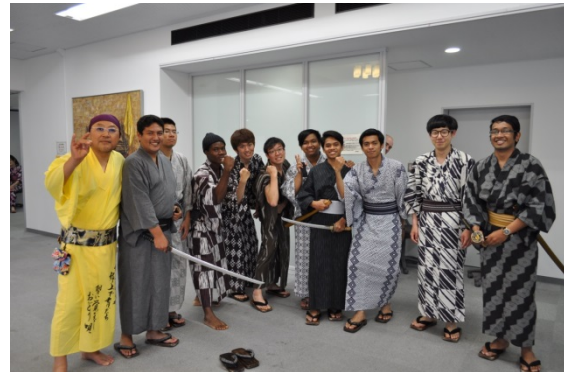
Instructor and boy students