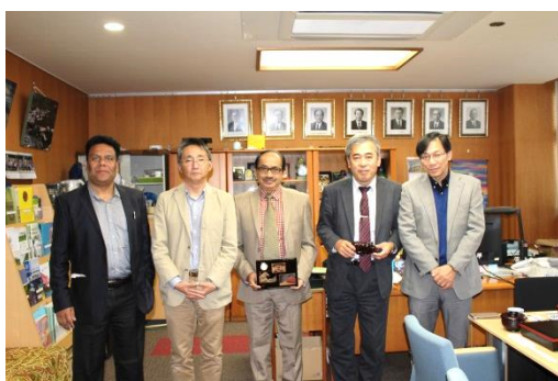
At the Office of the Dean of UGSAS

*IC-GU12: "International Consortium of Universities in South and Southeast Asia for the Doctoral Education in Agricultural Science and Biotechnology" which was created under the initiative of Gifu University.