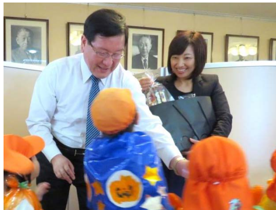
Children at Day-care Center visit the Office of the President in Halloween costume (October 31)