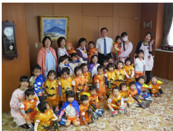
Group photo at the Office of the President

Their visit to the Office of the President and the Department has become one of the unforgettable moments in autumn filled with children’s big smiles.