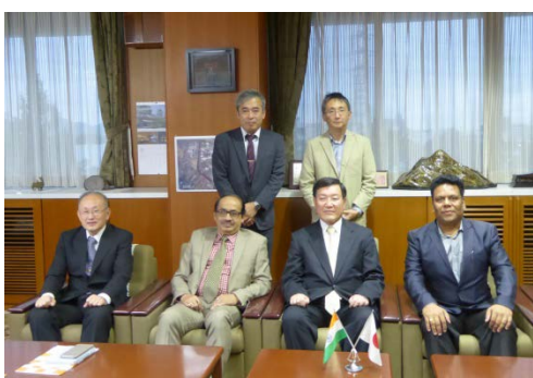
At the Office of the President

The two delegates were later invited to the UGSAS building and they actively exchanged opinions with the teaching staff about a realization of double-degree program at doctoral program with a view to further facilitating exchanges of students at doctoral programs, researchers, teaching and administrative staff based on the current MOU between the School of Life Science and UGSAS.