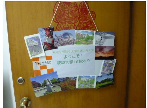
Entrance of the Program Office