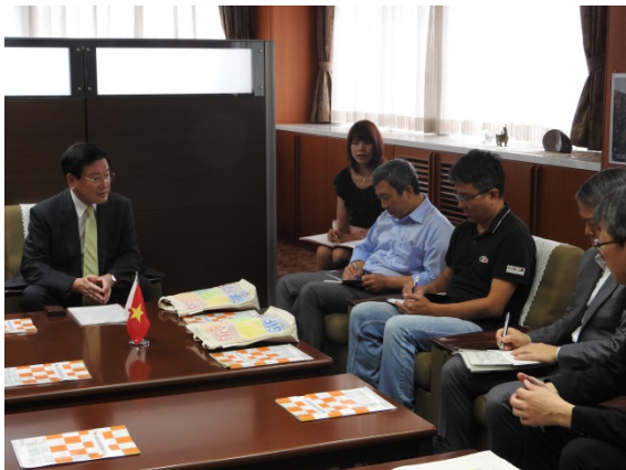
The delegates meeting with the President