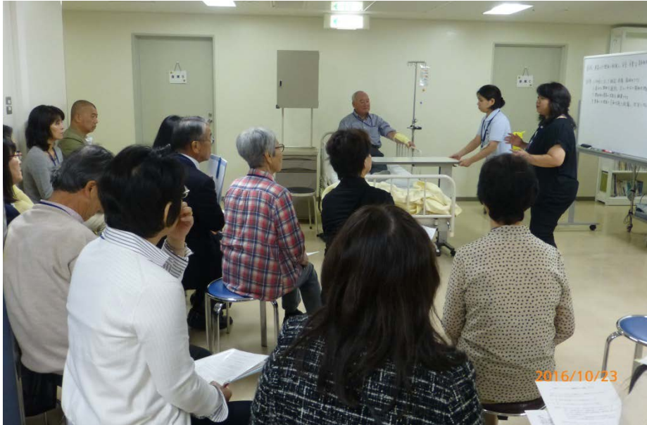
Workshop for “Study Meeting for Simulated Patients”