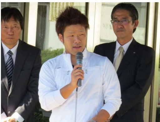
A student expressing his expectations for the project