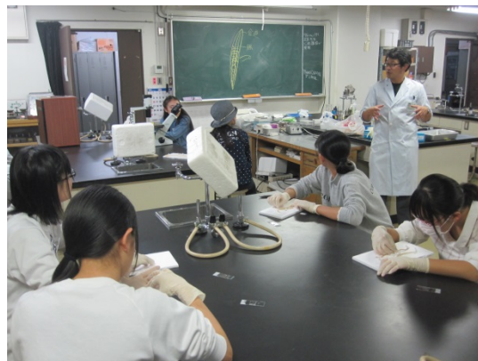
Lecture: "Let's take a look at the world of parasites"