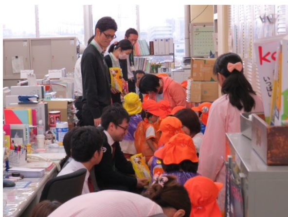
At the Human Resources Development Department