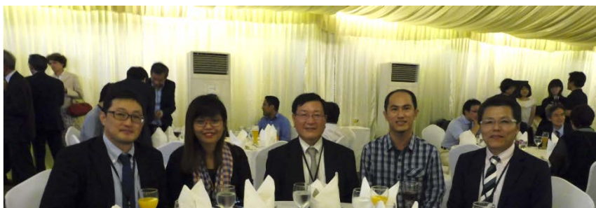
Alumni Association meeting