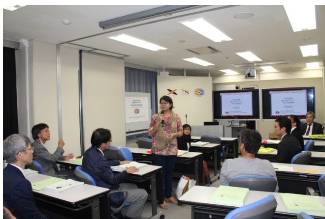
Scene from the entrance ceremony