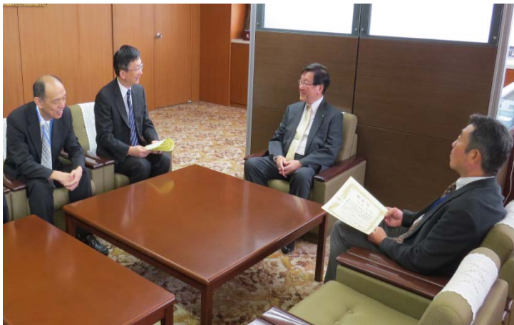
Meeting with the President