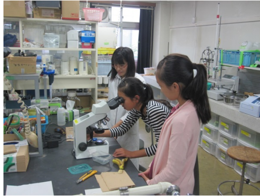
Lecture: "Let's look at the microscopic world"