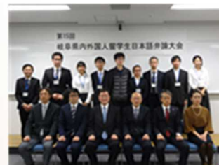
The 15 th competition speakers and judges

17:15 ~ 18:15 Informal Gathering with Local Businesses