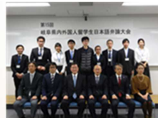
The 15 th competition speakers and judges

17:15 ~ 18:15 Informal Gathering with Local Businesses