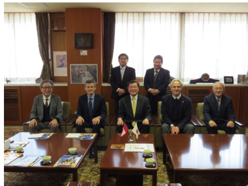
(From left at front row)