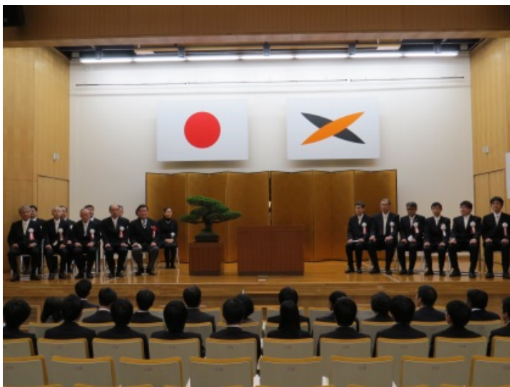
Scene of the ceremony