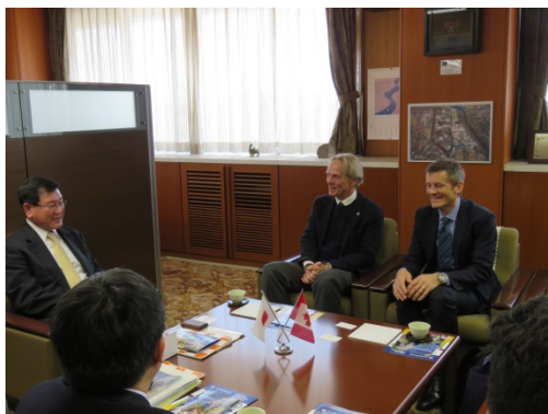
Meeting with the President

There are a number of common aspects between the two universities such as composing faculties, scale, location and close ties with local communities. It is highly expected that active exchange will continue between two universities in wider range of fields in the future.