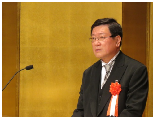
AY 2017 Gifu University Entrance Ceremony for Undergraduate and Graduate Students is held