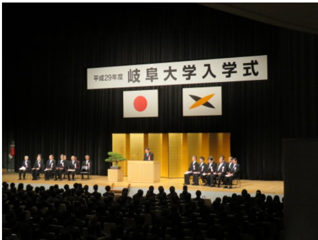
Scene of the ceremony