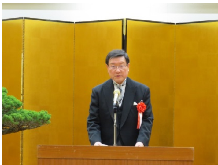
President giving a speech