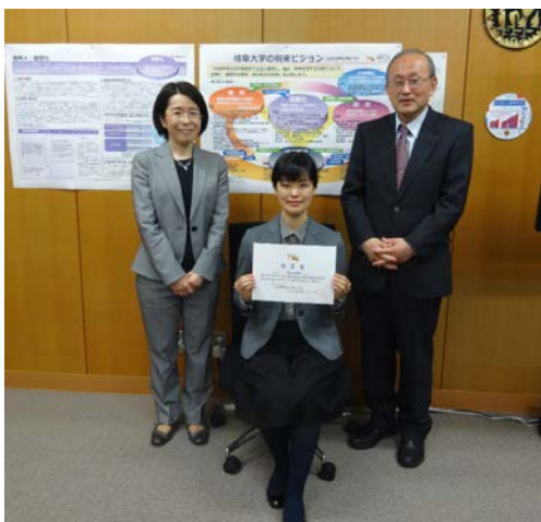
The 2nd Commendation Ceremony

This project started in 2015 based on a proposal by young staff of the university. The aim of this project is to promote internationalization in office work and to improve student services by boosting the number of staff who are highly capable of communication in English. We will continue this project to expedite our globalization initiatives for the days to come.