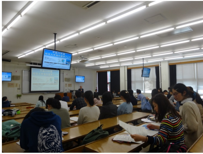
Scene of the fair