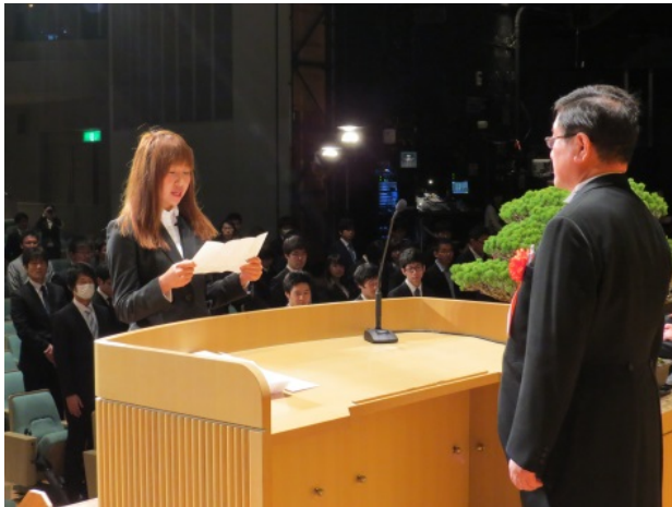
Graduate student making her statement