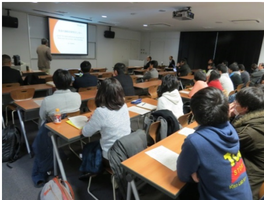
Many students from both universities attending the meeting