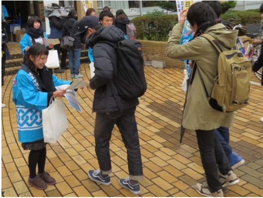
Members distributed flyers to each passing student