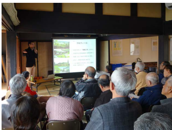
The 5 th lecture in session

Gifu University would like to extend a heartfelt appreciation to everyone who came to Gifu University Hayano Residence Seminar House for the delivery lectures in 2016. We look forward to your continued attendance in 2017.