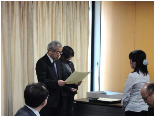
Scene of the awarding ceremony