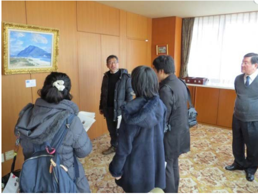
Campus tour for other art works after the press conference