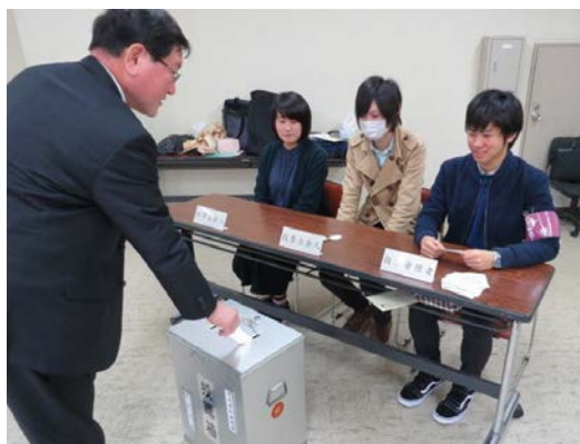
An Early Voting Station is set up at Gifu University for the 19th Gubernatorial Election of Gifu Prefecture