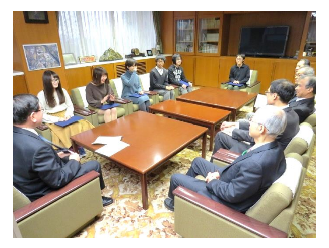
At the Office of the President