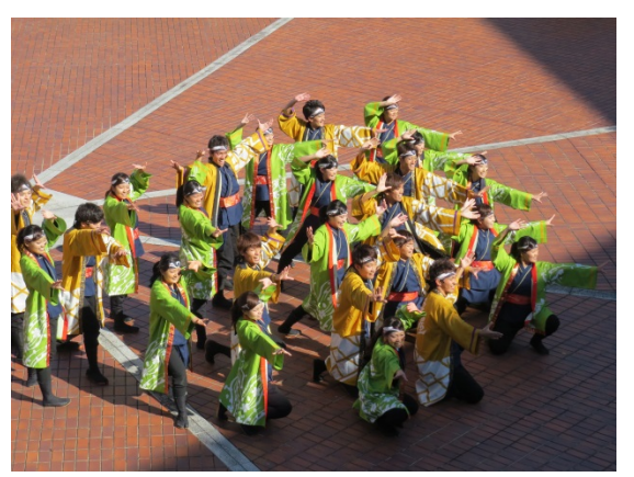
Yosakoi Circle, "Souya" performance