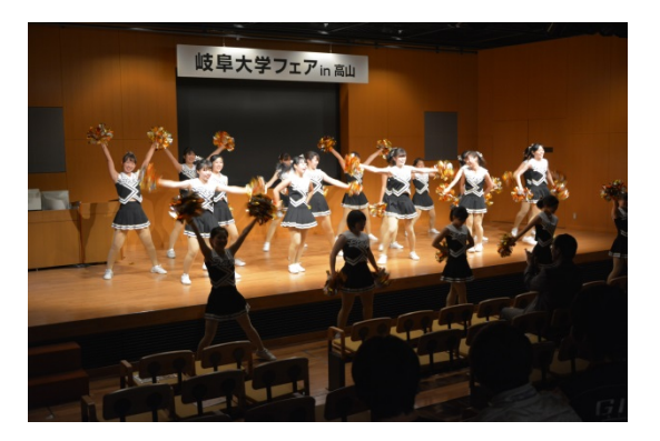
A cheerleader squad, "Stars" on stage