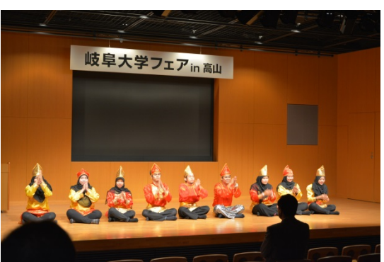
Dancing and singing by international students