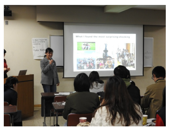
A student making a presentation

Summer School Program of Northern Kentucky University. During these two sessions, the speakers underscored the importance of studying abroad with specific purposes in mind and proactive studying. The audiences seemed to be very impressed with the speakers who tried their best to survive with their English abroad. The two sessions of English Lounge turned out to be the "real" special sessions for both the speakers and their audiences.