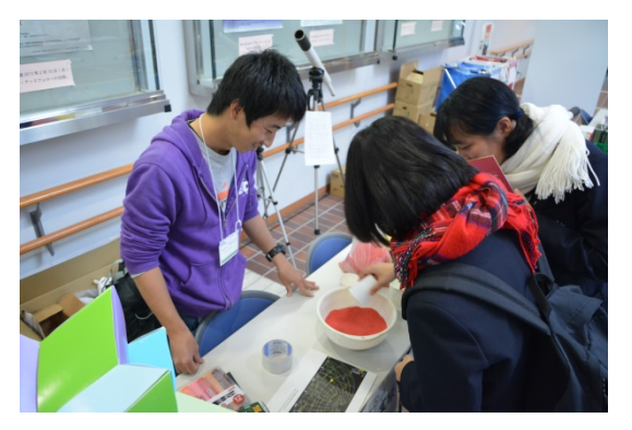
Senior high schools joining a program