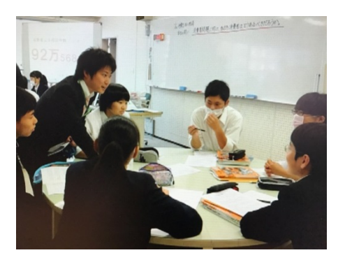
Students discussing in class

The training classes on November 22 presented a significant opportunity to contemplate future school and consumer education to all participants.