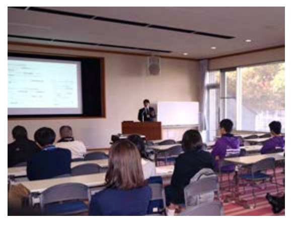
Reporting on research results