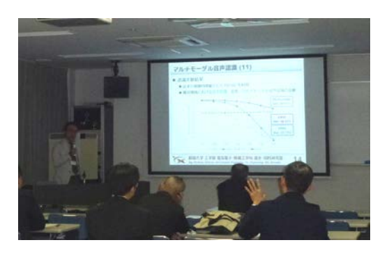
Presentation by a researcher (one participant raising a question)