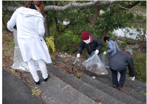
People picking up trash at the riverside