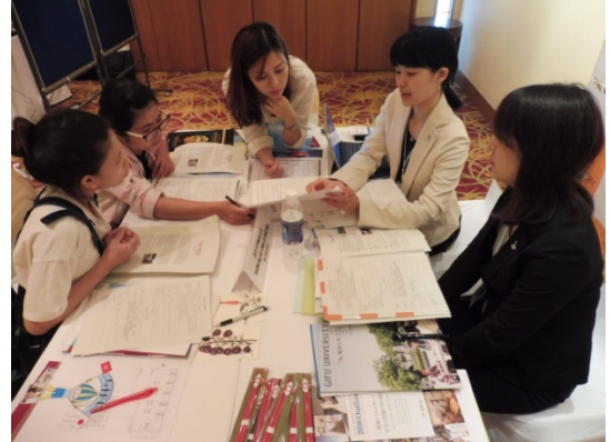
Consultation service for study abroad at "GIFU Study Abroad Fair" in Hanoi