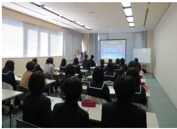
People experiencing a lecture