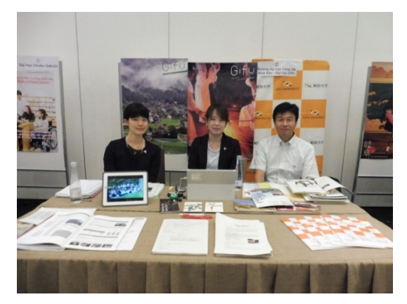
Gifu University booth at "GIFU Study Abroad Fair" in Ho Chi Minh

4. GIFU Study Abroad Fair (organized by Gifu Prefecture) (November 18 to 20) Gifu University joined "GIFU Study Abroad Fair" held in Viet Nam, which was organized by Gifu Prefectural Government. The aims of the fair include recruitment of Vietnamese students for universities and educational institutions within Gifu Prefecture, and the fair was held in two cities, Hanoi and Ho Chi Minh City. Gifu University staff offered consultation services to students who are interested in studying at Gifu University and held meetings with staff of educational institutions in Viet Nam at Gifu University booths in respective cities. About 400 people came to the two fair sites indicating people's great interest in studying in Japan.