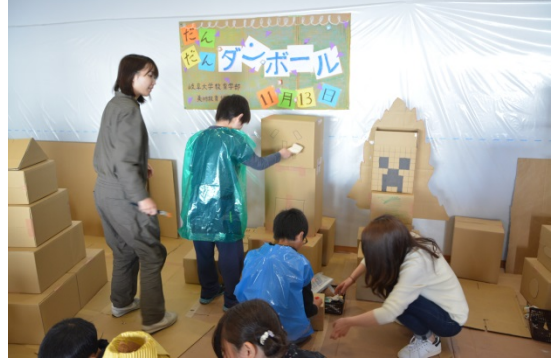
On-site study session organized by the Faculty of Education students