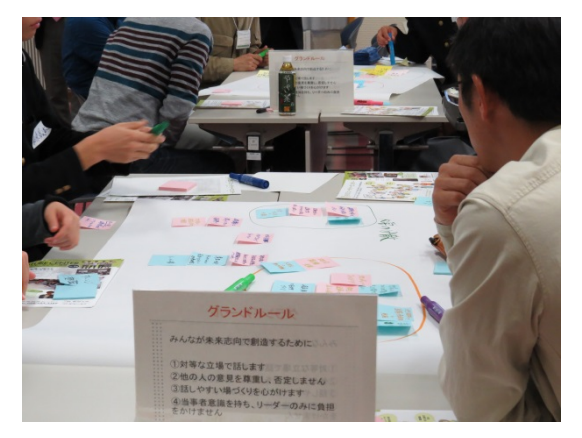
Gifu Future Center