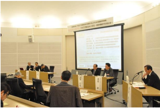
A scene from a panel discussion