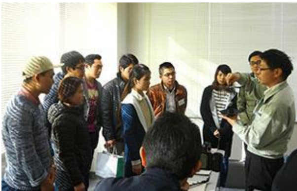
An official of Muto Seiko CO. explaining to the tour participants