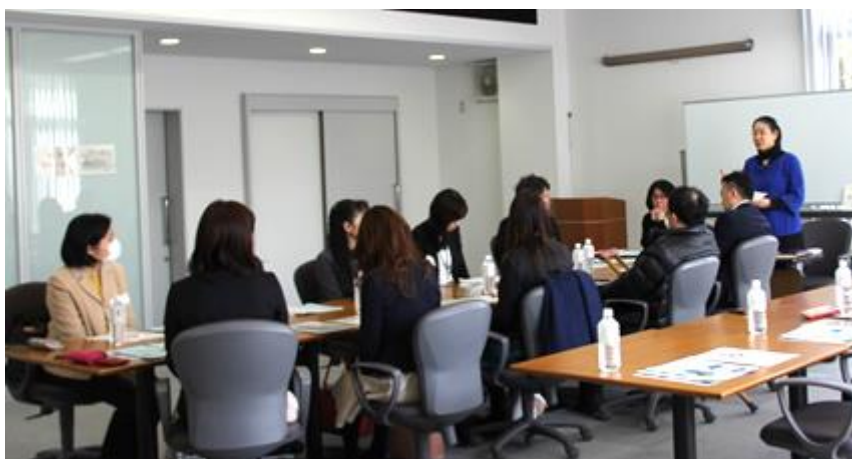
Participants exchanging opinions

The Gender Equality Promotion Office will continue to address various challenges ahead for gender equality while working with municipalities in Gifu Prefecture.