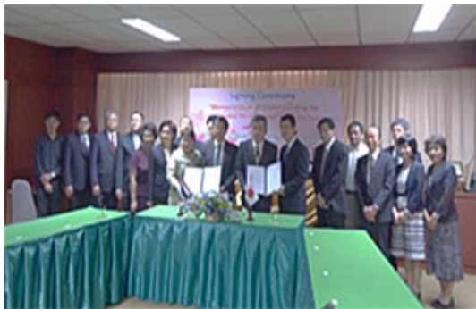
Commemorative photo after the signing ceremony