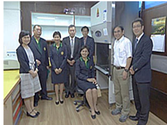
Communication test of the remote lecture system with UGSAS Visit to the proposed site for the workshop