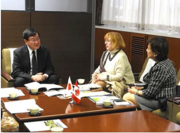
Meeting with the President