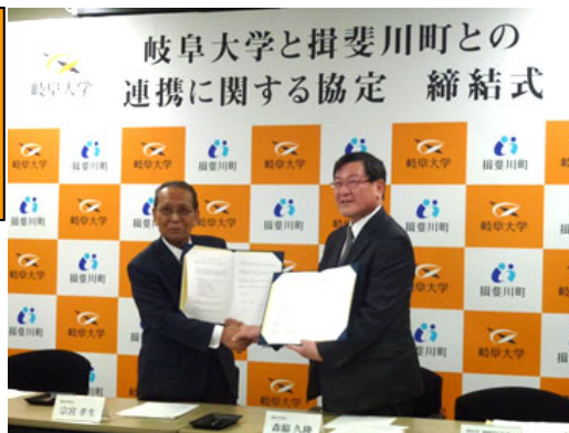
Partnership Agreement with Ibigawa Town (January 19)