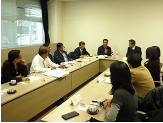
Meeting at the Faculty of Education