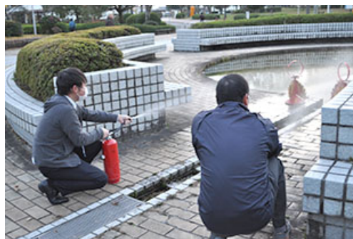
Scene of the firefighting training