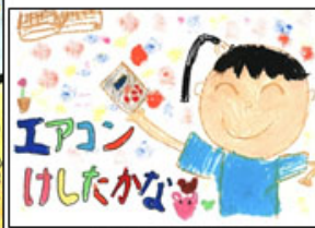
小学校低学年部門 「エアコン けしたかな」