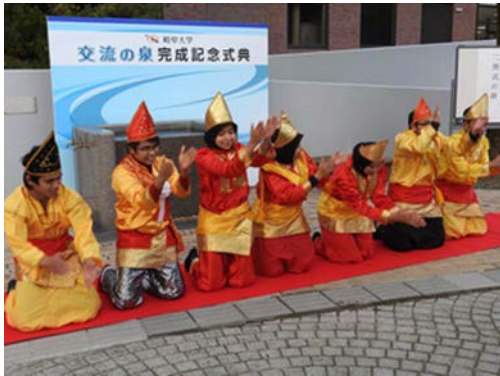
Dancing and singing performances by Indonesian students