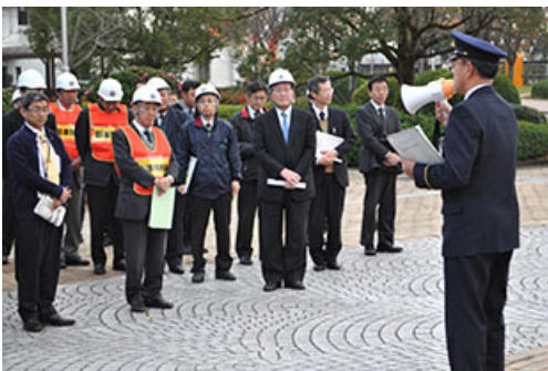
Scene of the evacuation drill

Gifu University will conduct campus-wide emergency drills on a regular basis with the aim of raising public awareness of disaster prevention.