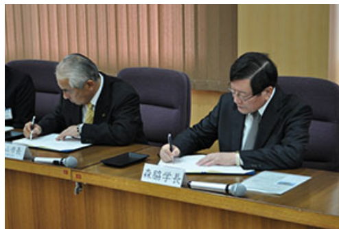
Scene of the signing ceremony