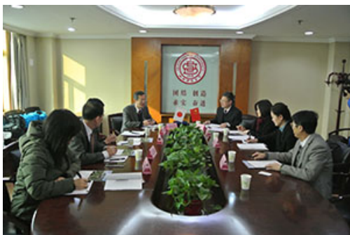
Scene of the signing ceremony