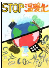
中学校部門 「STOP 温暖化」