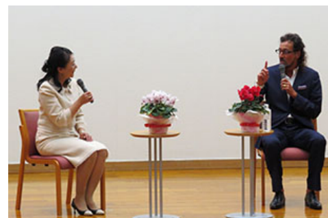
Special lecture by Mr. Ruy Ramos (right)