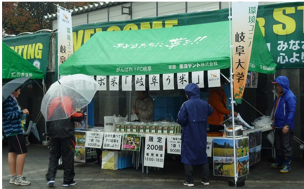
Scene of rice sales

Gifu University promises to continue efforts for environmental conservation with the cooperation of FC Gifu.