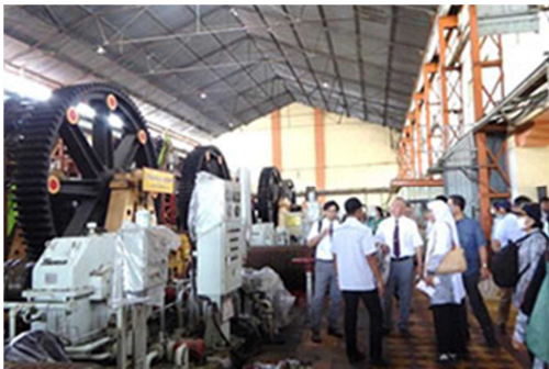
Sugar refining plant tour