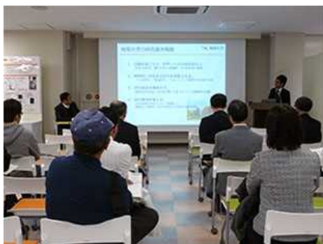
Presentation on activities at Gifu UniversityPoster session

Many programs such as the Special Lecture in Fall sponsored by the Gifu University Association for Community Activities and Collaboration, a symposium sponsored by the Comparative Cancer Center of the Faculty of Applied Biological Sciences, the University students' experiment classes for elementary and junior high school students, and sales of the farm products of Yanagido Farm simultaneously took place during the Fair. The Fair provided a good opportunity for many visitors to learn about a wide variety of activities of Gifu University.