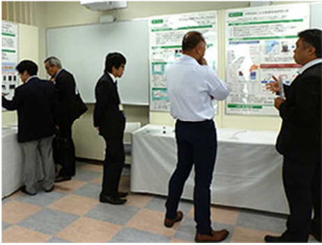
Visitors watching the introduction of faculties