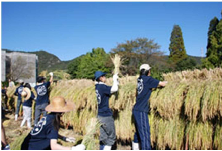
Students of a farming support circle putting the sheaves on a rack.