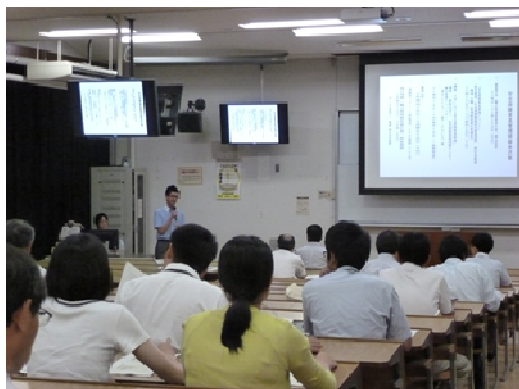
Scene of the workshop