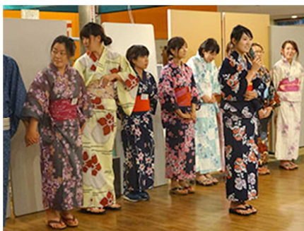
Student tutors sing in a chorus