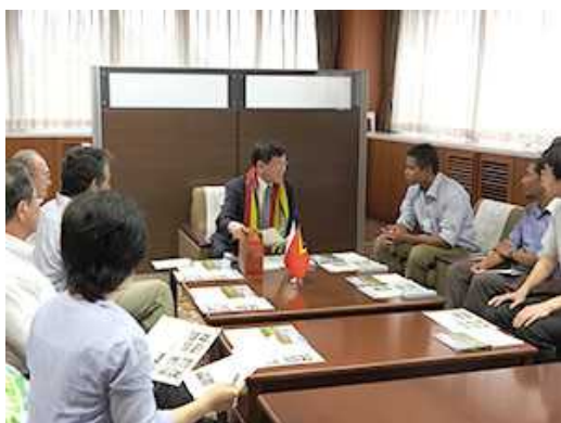
Meeting with the President

Based on this meeting, Gifu University will examine concrete measures for how to cooperate with the JICA Project, and thereby contribute to the development of the Faculty of Engineering, National University of Timor-Leste in the future.