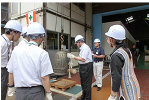
The president rings a bell manufactured at Nabeya