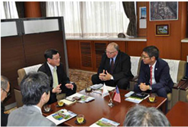
Meeting with the President

Meeting participants expressed their hopes that the MOU between Gifu University and UAFS represents the first step toward a long-term, vital friendship in the years to come.