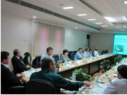
Meeting among IITG, IIMS and Gifu University