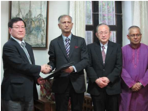
Signing Ceremony at the University of Dhaka