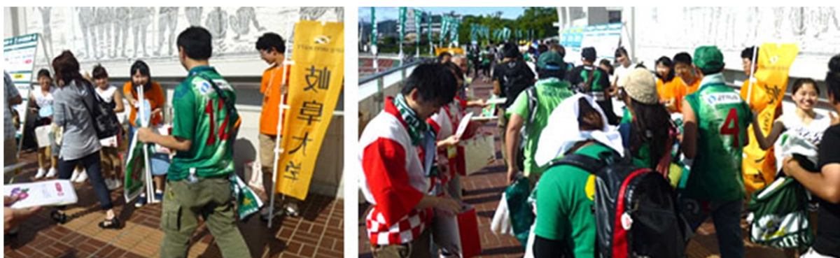
Volunteer students handing out seeds

Gifu University remains committed to promoting further activities for environmental conservation with the cooperation of Juroku Bank and FC Gifu.