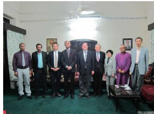
At the University of Dhaka