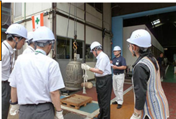
The 9 th Local Business Inspection Tour (June 30)