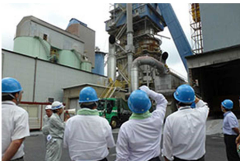
The participants inspect the factory of Kawai Lime Industry

Gifu University will continue to organize local business tours for human resource development and support the employment seeking activities of the University's students.