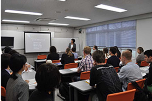
Opening Ceremony and Orientation

Please keep your eye on the update of this year's summer school program!