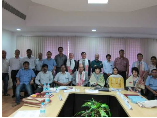
Group Photo of IITG, IIMS and Gifu University officials