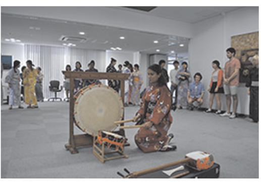
Beat a drum