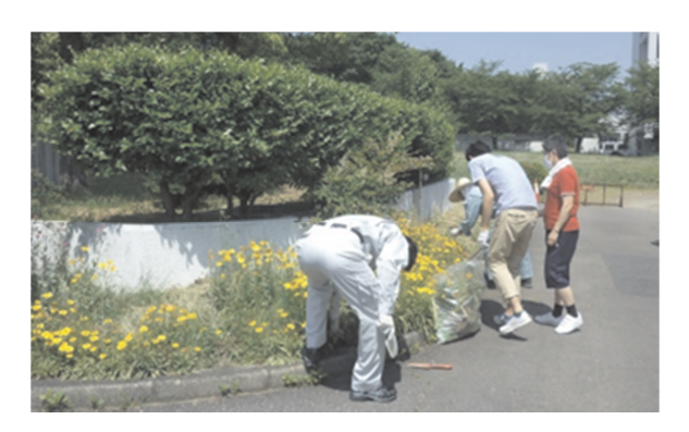
At the Faculty of Education

In the clean campus campaigns, participants pick up trash at riverbanks and the roads close to the campus as a part of community cleanup activities. About 30 students and the staff from each faculty walked along Shinboriwa River (approx. 2km long) and picked up cans, bottles and plastic bags, etc. for about an hour. They also worked together to eradicate the non-native plant, Coreopsis Lanceolata.