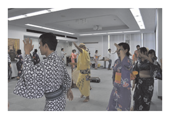
International students dancing in circle