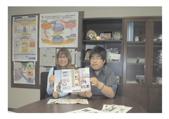
Students interviewed by the newspaper reporters

*2 an old castle town famous for the well-organize water conduits for fire prevention