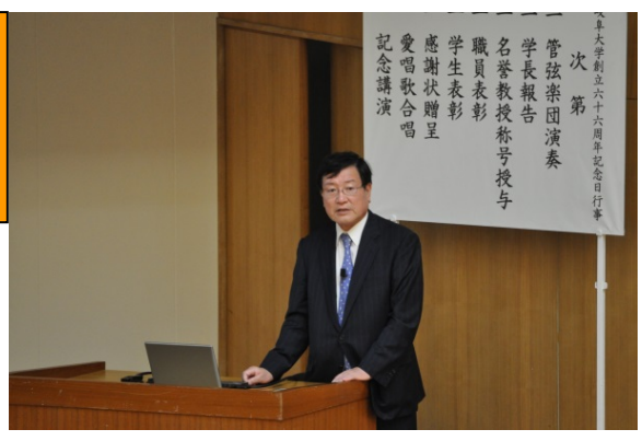
The 66^{th} Foundation Anniversary (June 1)