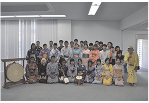
Group photo session