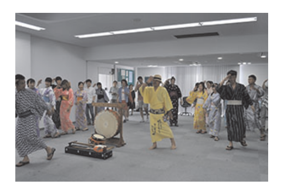
Practicing "Kawasaki" dance