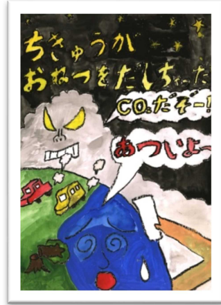
Division for Elementary School (Senior Students) “Our Dear Earth says, “I got a high fever.”