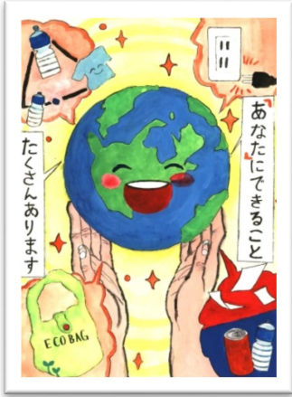
Division for Junior High School “What you can do today”