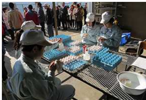
Farm workers remove dirt on egg-shell surface