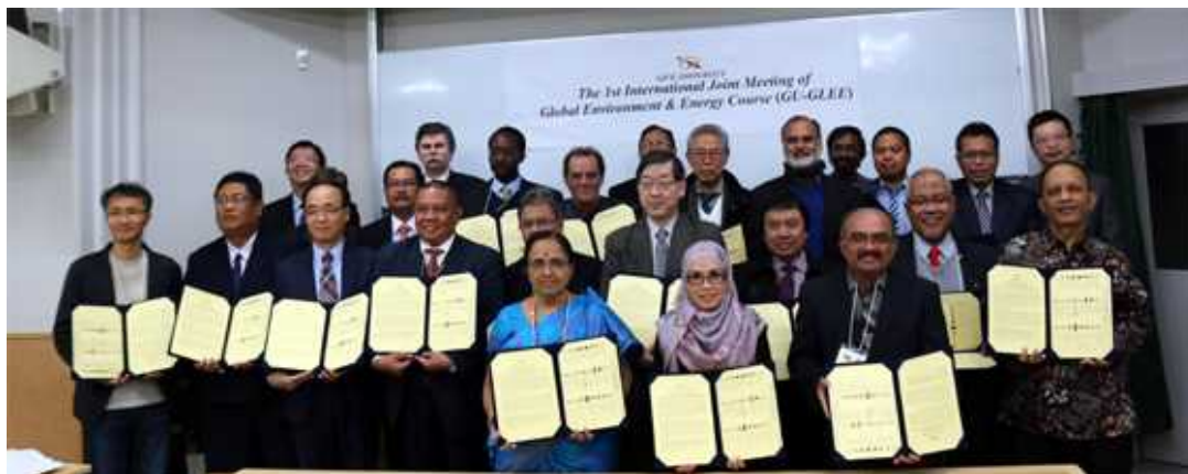
Participants with Joint Communiqué in hand (The Faculty of Engineering)