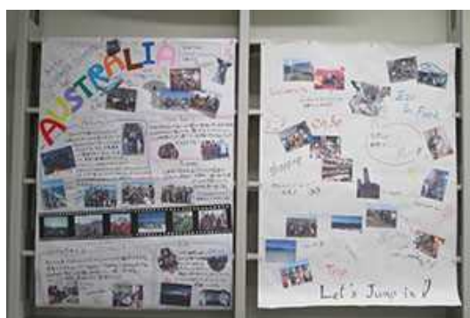
Posters made by students who participated in summer school program