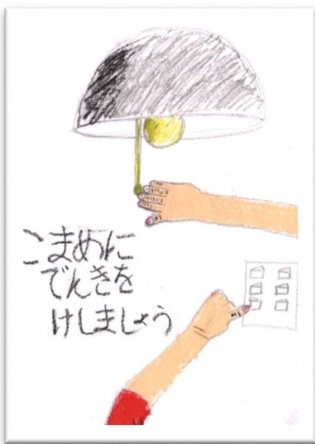
Division for Elementary School (Junior Students) “Switch off to save electricity”