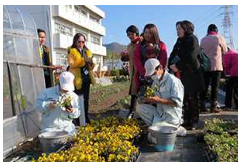
Delegation sees trainees deadheading blossoms

They actively asked questions concerning employment conditions and works during the tour, and it turned to become quite a successful visit.