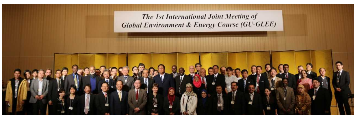
Group Photo at Gifu Miyako Hotel

Agricultural University sang karaoke, “Kitaguni-no-haru (Spring has come to Northern Japan) in his fluent Japanese.