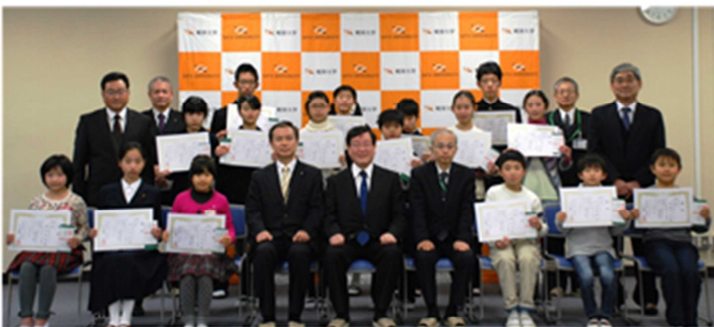
Group Photo with award winners

Through these poster activities and various eco-friendly programs, Gifu University aims to enhance people’s consciousness about environmental issues including global warming and recycling, and also strives to deepen local residents’ understanding about environment in cooperation with The Juroku Bank, Ltd.