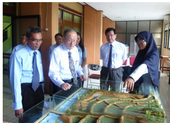
IC-GU12 Lab-Station (Environmental Science)