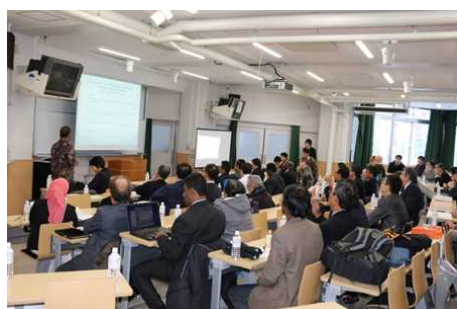
The Faculty of Engineering