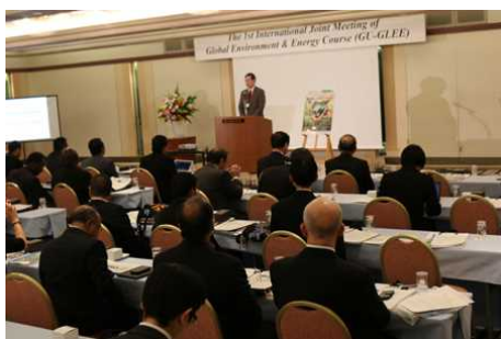
Meeting at Gifu Miyako Hotel