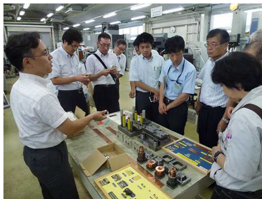
Participants on a laboratory tour