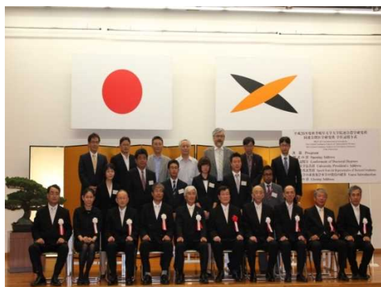
Faculty members of the UGSAS