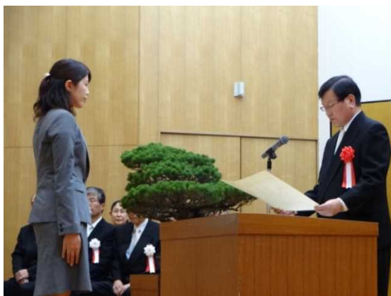
Conferment of degree

The UGSVS 6 for Course Doctorate, 5 for Dissertation Doctorate