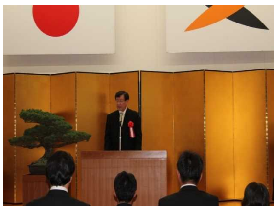
A farewell address of the President