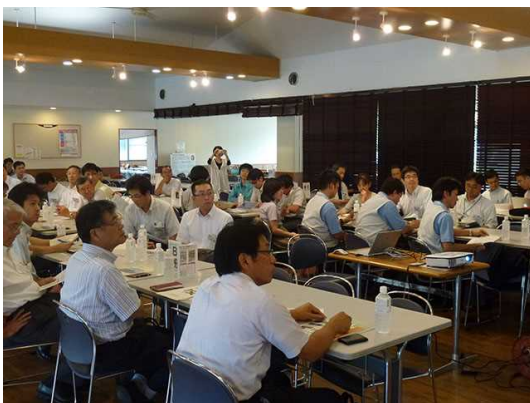
A lecture delivered before a tour

Gifu University is not only working on basic study but also practical research that the result can be returned to industry. Participants who learned about the research conducted at Gifu University through the laboratory tour expressed their hope of joining another laboratory tour. It was an important opportunity to reaffirm that a laboratory tour is necessary to enhance the relationship with companies in the region.