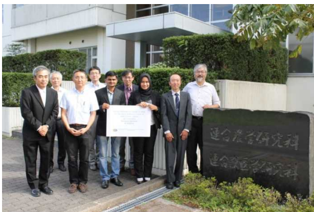
Faculty members of the UGSAS

The UGSVS 8 students for Doctoral Course