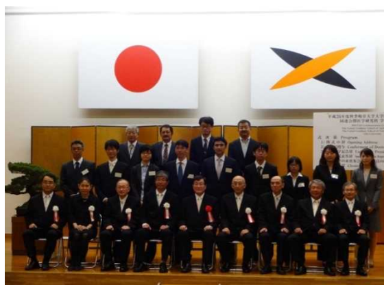
Faculty members of the UGSVS