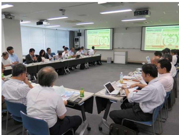
Attendees exchange information in the meeting

In the meeting, a new proposal for student exchange projects using the network of 13 participating universities was made, and the participating schools agreed to work together on the COC program.