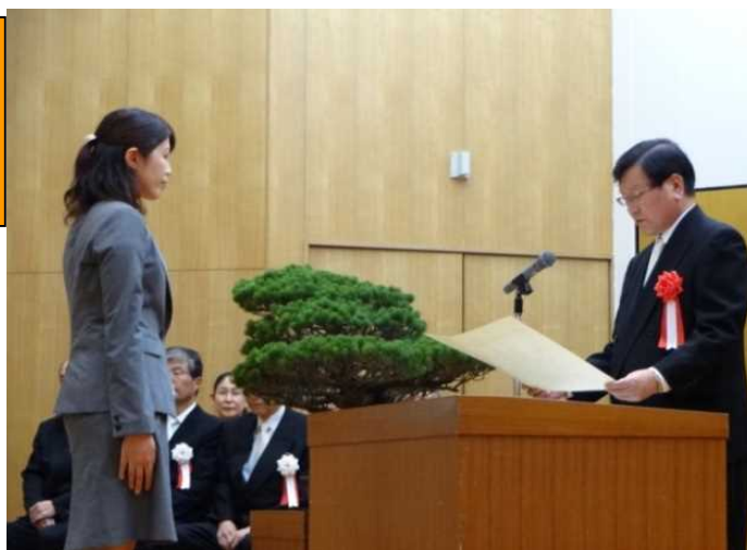
Fall 2014 Commencement Ceremony of the United Graduate School of Agricultural Science (UGSAS) and the United Graduate School of Veterinary Sciences (UGSVS) (Sep. 24)