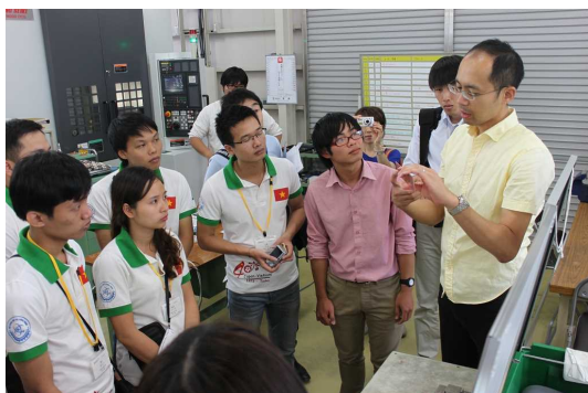
Facility tour of the Center for Advanced Die Engineering and Technology

Although the visit of the delegation was short, it was a great success as it deepened mutual understanding and exchange between Vietnamese students and Gifu University students.