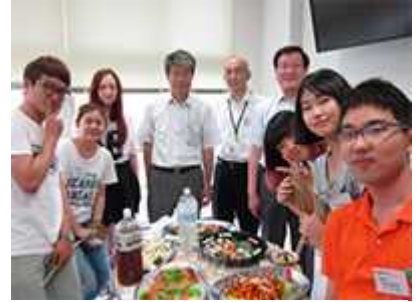
Luncheon party with board members