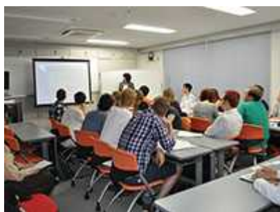
Opening ceremony & guidance session

Gifu University summer school program has been selected as a scholarship program supported by Japan Student Services Organization (JASSO) since 2012 (Scholarship for short-term stay program for FY 2012, and scholarship for short-term study in Japan for FY 2013 and 2014).