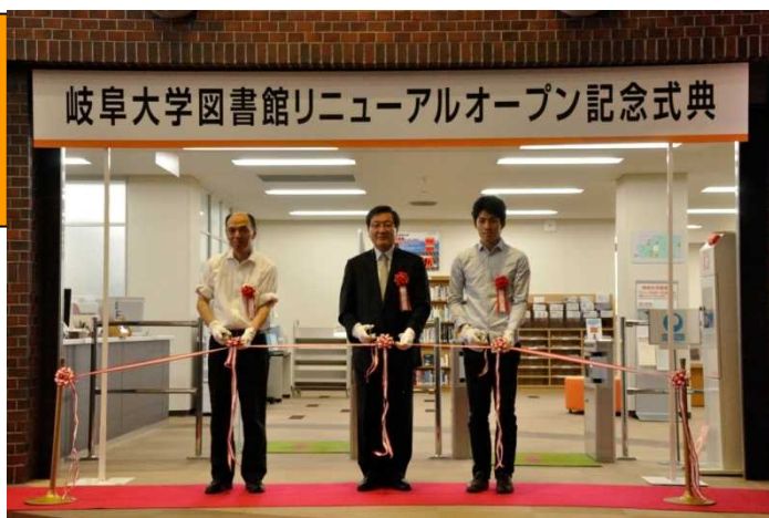
Gifu University Library Reopening Ceremony (July 1)