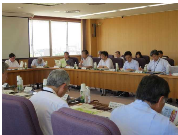
The attendees exchange their opinions