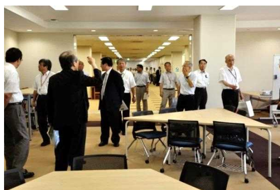
Touring the library (Learning Commons)