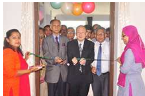
Gifu University Dhaka Office Opening Ceremony

Gifu University Dhaka Office was established in August 2009 within the office building in Dhaka. In July 2013, the office was relocated to University of Dhaka, but the University is kind enough to arrange the official opening ceremony for the Gifu University Delegation. Gifu University Dhaka Office is a sole Japanese University overseas office in Bangladesh (excluding Japanese university research facilities) and is becoming a symbol of long-term friendship between University of Dhaka and Gifu University.