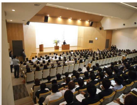
Students listen attentively to a lecture