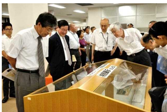
President and the attendees look at library special collection

After the ceremony, the ceremony attendees toured the library and walked into renovated browsing section and Learning Commons which was newly added. We received good responses from the attendees after the tour such as "We would definitely like to encourage students to use the library."