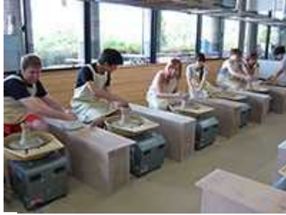
Throwing a cup or bowl on a potter's wheel (Toki City)