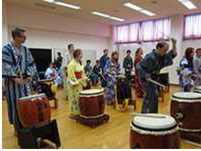
Trying Kokura Daiko wearing yukata (Mino City)