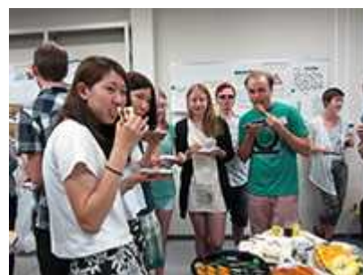
Students enjoy a lively conversation with tutors