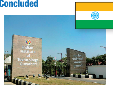
Indian Institute of Technology, Guwahati (IIT-G), India

Bioeconomy Unit, Häme University of Applied Sciences (Finland)