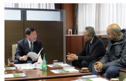
Courtesy Visit from University of Campinas, Brazil